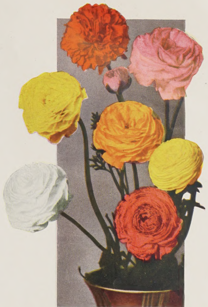
RANUNCULUS, TECOLOTE GIANTS, MIXED